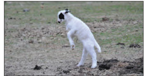
Rorschach the lamb practices his dance moves.