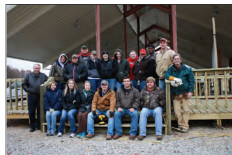
Members of the Agricultural Structures Class on completed deck.