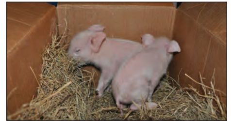
Baby pigs, Angus & Malcolm