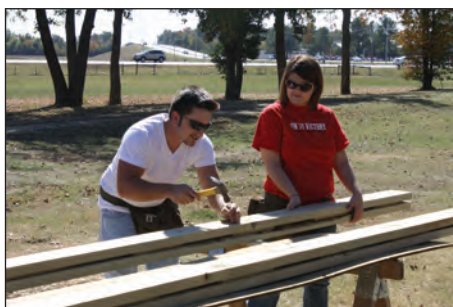
Students work on the deck.