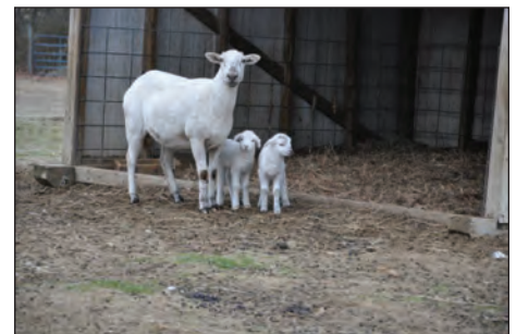
Scenes from the ASU Farm.